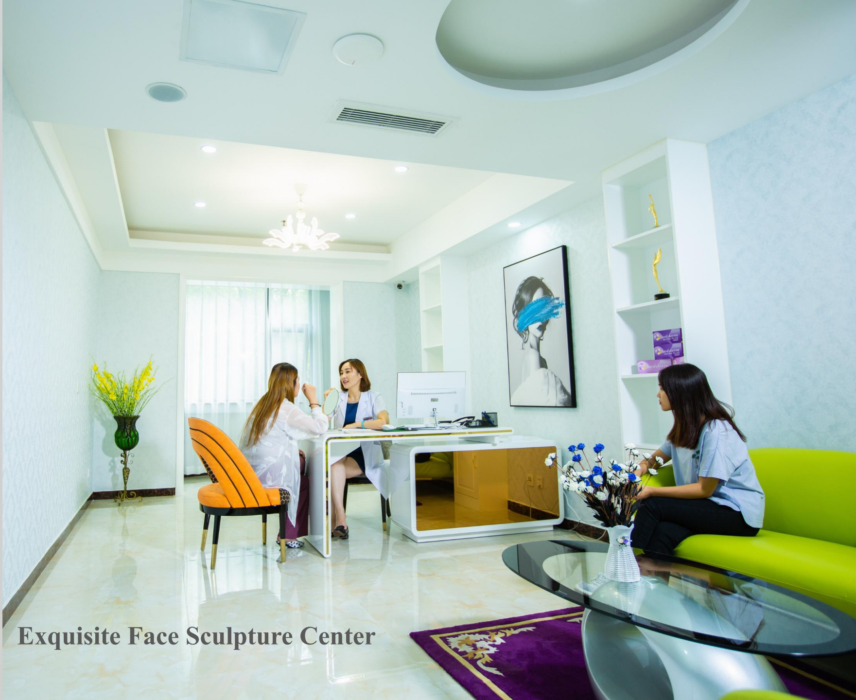
Exquisite Face Sculpture Center